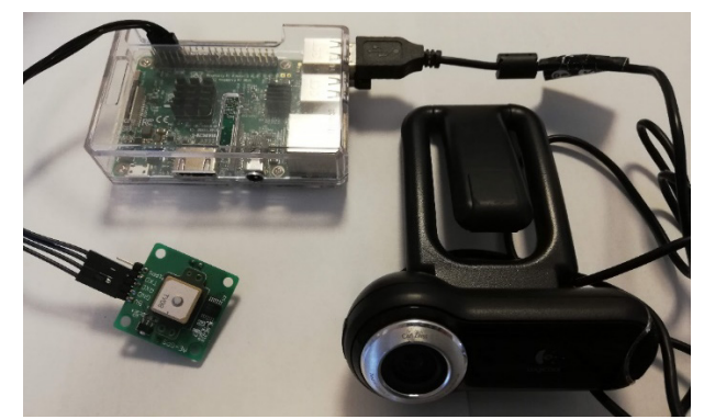
Fig. 1 Raspberry Pi, camera, and GPS module used for the prototype creation