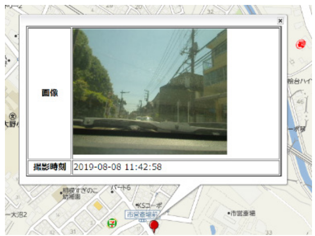
Fig. 4 A display example when a marker is clicked