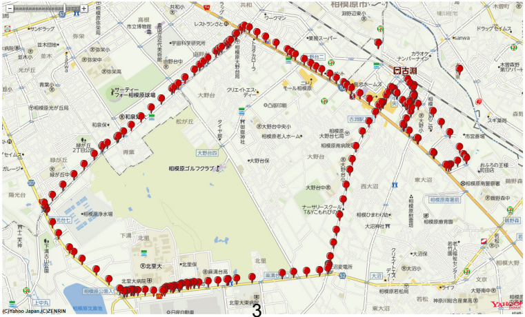
Fig. 3 A display example of the mapping system

An experiment was conducted to verify the practicality of the proposed system. In this experiment, the prototype was installed in a general passenger car and the system was operated during driving. 37 images were posted, and it was confirmed that the system was operating normally. The location information was traced almost accurately. However, there was an error of up to 20 meters between the location where the image was taken and the location on the map. This is thought to be due to the fact that there is a slight time lag between the acquisition of position information and the image capture in the prototype program. However, this error is not considered to cause a big problem in using the system in practice.