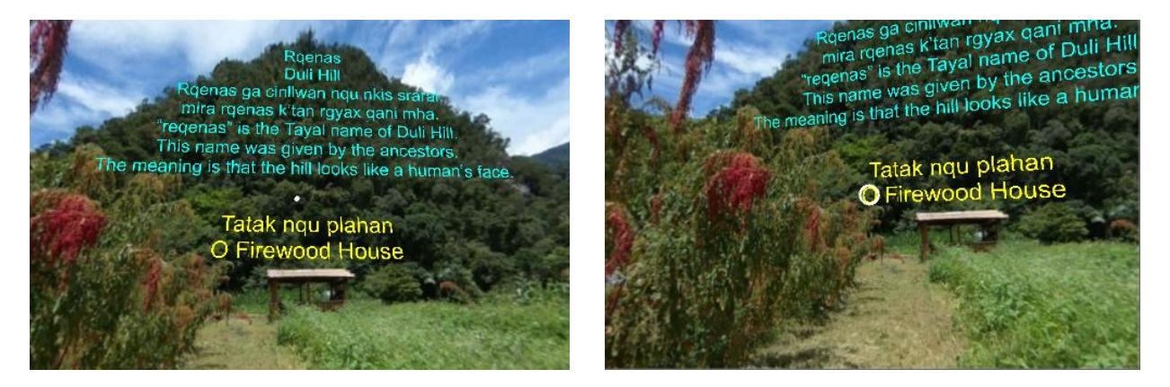
Figure 5. User interface (The white dot in the left figure is the center of user's sight. When user turns around to let the white dot aim at the yellow circle beside "Firewood House", the white dot will turn into a small white circle. Then, user can switch to the scene "Firewood House" by pressing the button on the Google Cardboard.)

In Unity, we can switch the position of the camera among six scenes by programming a C# script (Figure 4). As a result, when the center of the user's screen is aimed at the specific little circle of the target in the scene (Figure 5 right), the user can switch to the target scene by touching the phone's screen or pressing the button on the Google Cardboard.