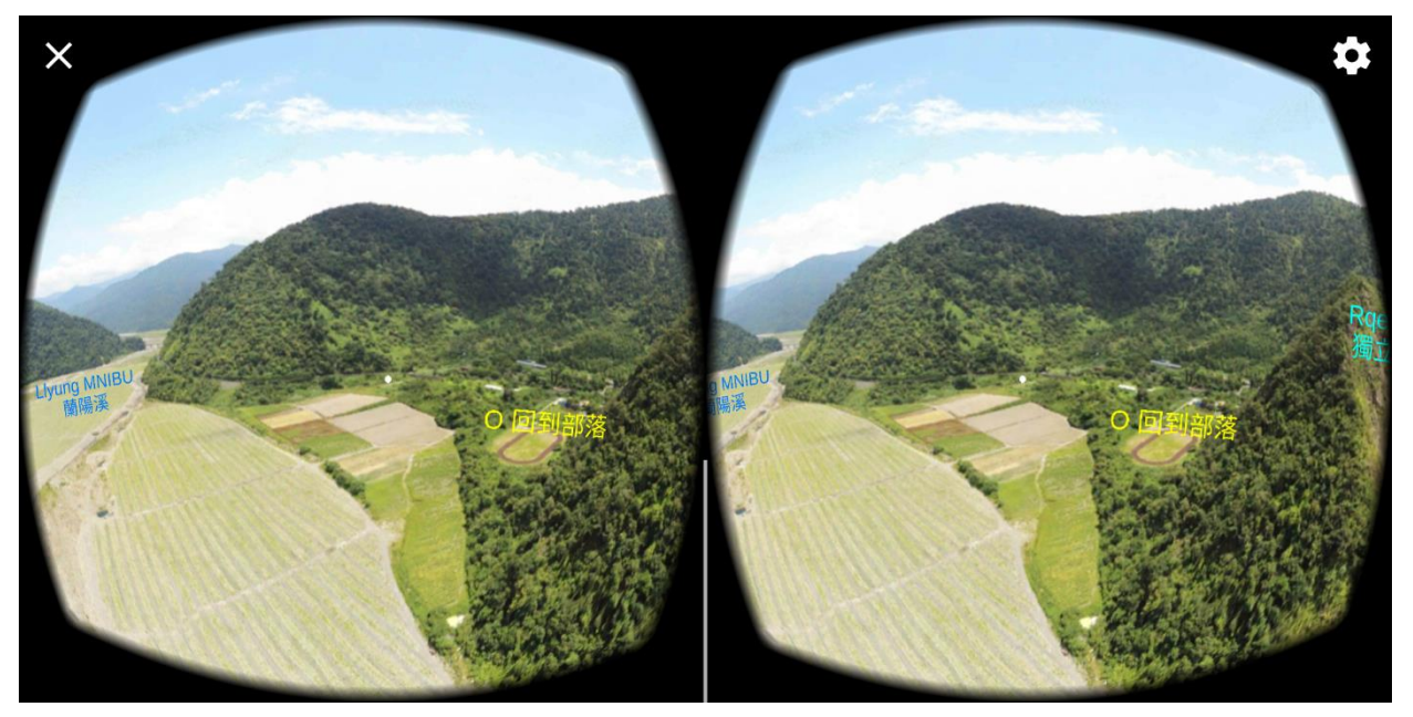
Figure 6. The interface in the VR APP