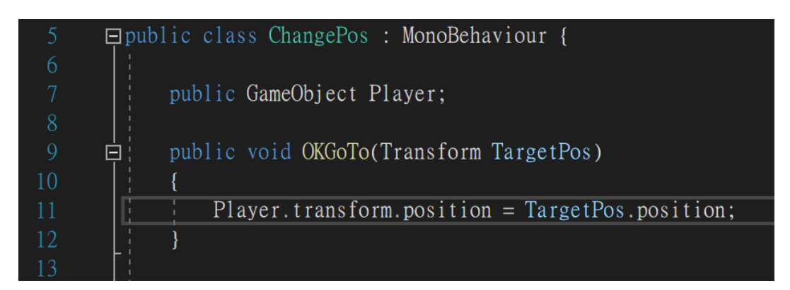
Figure 4. C# script code to switch the position of camera between scenes ("Player" is the camera. "OKGoTo" is the function name we create. "TargetPos" is the coordinates of the center of the target scene)

In Unity, we can switch the position of the camera among six scenes by programming a C# script (Figure 4). As a result, when the center of the user's screen is aimed at the specific little circle of the target in the scene (Figure 5 right), the user can switch to the target scene by touching the phone's screen or pressing the button on the Google Cardboard.